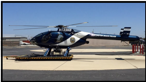
HBPD Citizens Academy Brochure, Rev. 7-2021

Whether you are a community leader, a long term resident, new resident, or live outside the city but work in the City of Huntington Beach, your attendance is welcome. The only additional requirements are that you must be at least eighteen years of age, have no outstanding warrants for your arrest, and no pending criminal cases.